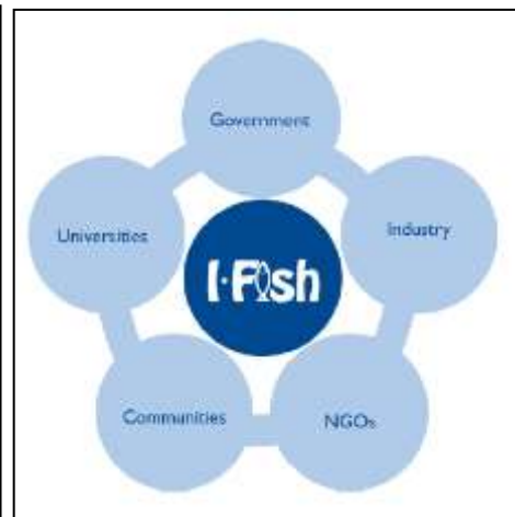
Figure 2. Members of the Tuna Fisheries Co- Management Committees.